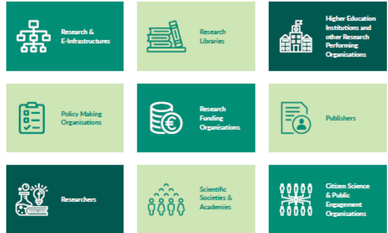
Figure 1. Major stakeholder groups with responsibility for open research 9

The stakeholders depicted in Figure 1 are invited to endorse this National Framework and to engage in the subsequent national planning process.